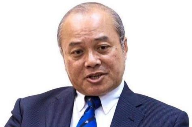
The whole land mass right up to the sea, must be considered a water catchment - not just the upper stream forested areas. - Datuk Lim Chow Hock

Detailed, multi-disciplinary research is needed to identify emerging pollutants in the water ways of such farming intensive areas, she says.