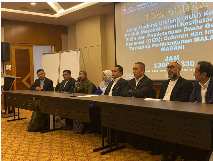
Health experts at a roundtable conference on the Control of Smoking Product for Public Health Bill 2023 and the Generational Endgame (GEG) policy, organised by Akademi Profesor Malaysia, in Bangi on April 17, 2023.

BANGI, April 17 – A group of prominent health experts in Malaysia has issued a 'Bangi Declaration' outlining 10 key recommendations to strengthen tobacco and vape control measures in the country, in response to the government's decision to remove nicotine liquids and gels from the Poison Act 1952.