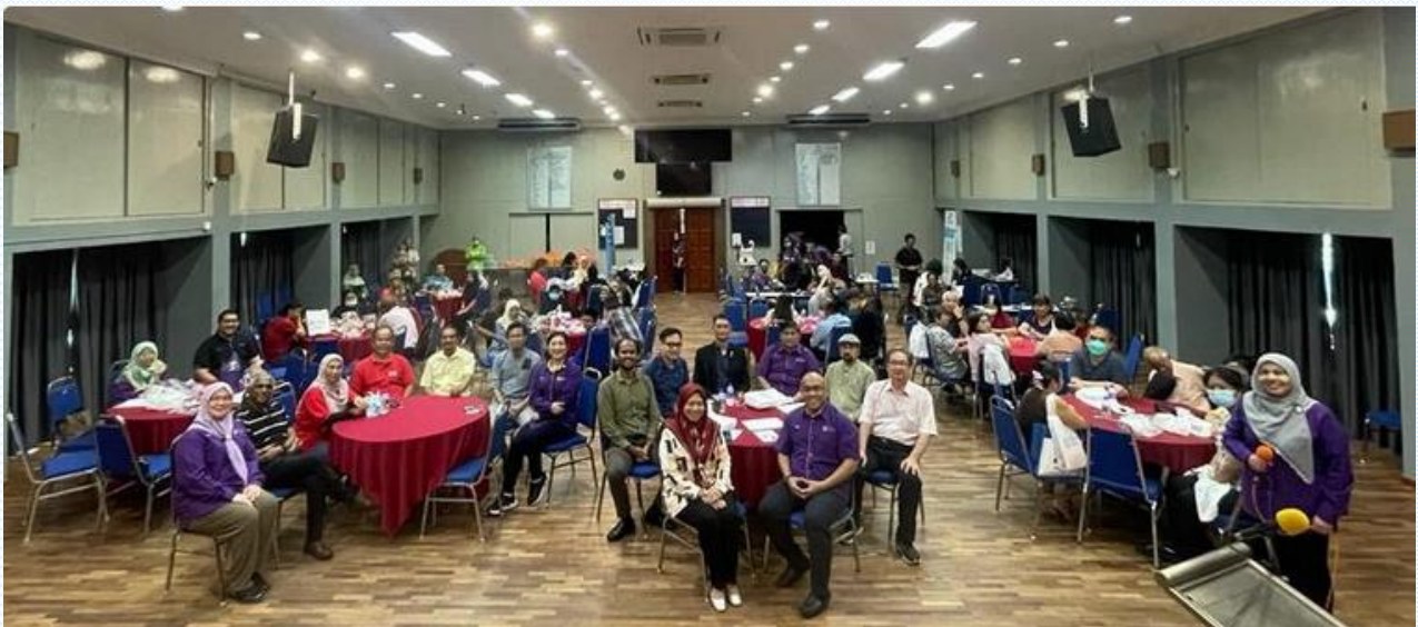
Among the participants and stakeholders involved in the Citra Rasa Talent Program.

This program was attended by BIM professionals and partners and participants among the visually impaired around the Klang Valley. This cooperation is not only able to foster the concern of professionals towards the disabled who are actually a component of civil society as conceived through Malaysia Madani. The six principles outlined, namely sustainability, well-being, creativity, respect, confidence and courtesy can certainly be effectively practiced by participants in such a program.