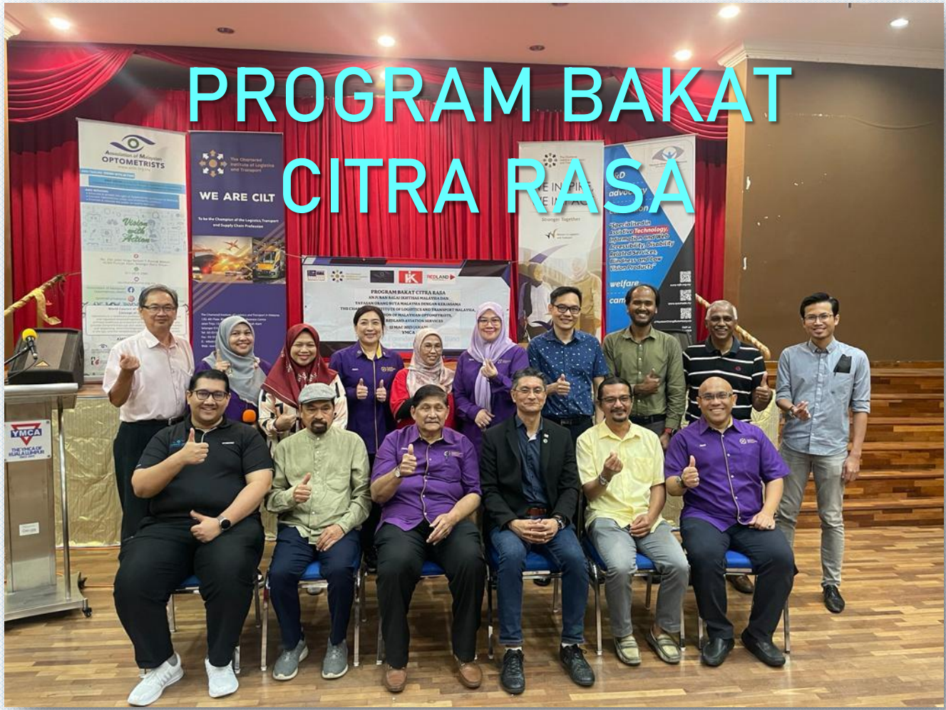
Program Bakat Citra Rasa with The Chartered Institute of Logistics and Transport Malaysia (CILTM) and Yayasan Orang Buta Malaysia 12 March 2023